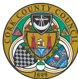
Cork County Council