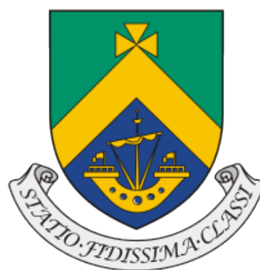
Cobh Town Council