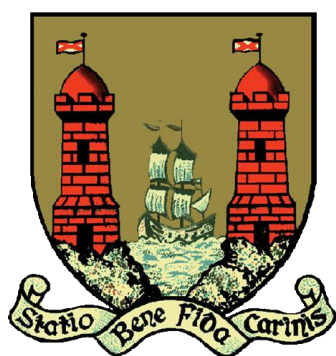
Cork City Council